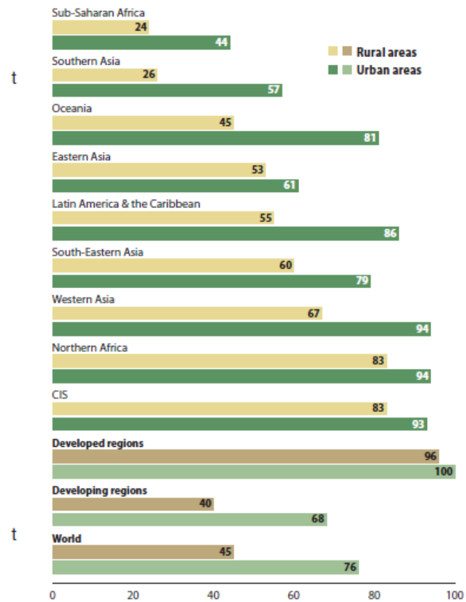
Proportion of population using an improved sanitation facility in urban and rural areas, 2008 (Percentage)